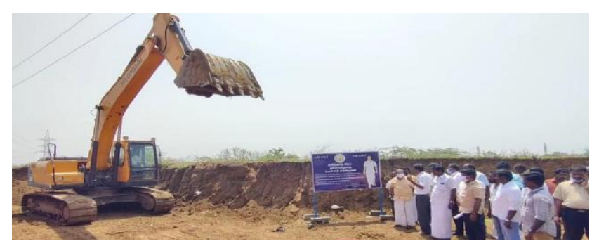
Widening the Adyar River's floodplain in Chennai

Floodplain Widening . A floodplain is a generally flat area of land next to a river or stream. It stretches from the banks of the river to the outer edges of the valley. Floodplains are natural flooding outlets for rivers. When a river floods, water spreads across the floodplain and slows down. Without floodplains, rivers would rise and move faster. Restoring floodplains to give rivers more room to accommodate large floods is the best way to keep communities safe. Giving rivers more room also provide a number of other benefits including clean water, open space for agriculture, recreation and trails, and habitat for fish and wildlife. Following Chennai's devastating flood in 2015, efforts are now undertaken to widen the floodplain of the Adyar River. Work has been completed on about 22 kilometers section of the river. Authorities have also commissioned a study on further widening of the Adyar River.