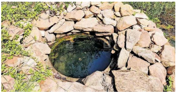
Panam Keni in Kerala

Panam Keni . Panam keni is a type of well used by the Kuruma tribes of Wayanad in Kerala. Wooden cylinders are made by soaking the lower stems of the native toddy palms in water for a long time. As the core of the palm rots away, only the hard outer layer remains. The resultant palm cylinder, measuring four feet in diameter as well as depth, is then immersed in groundwater springs located in fields and forests. Panam keni is used by the community as a source of drinking water. Being a shallow well, it does not require a rope, pulley or pump to lift the water out. One can just scoop the water out from the well with utensils.