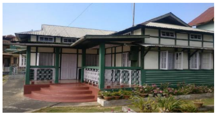
An Assam-type House in Shillong, Meghalaya

Ikra House : Ikra House, commonly referred to as "Assam-type house," is typically found in Assam and Meghalaya. The plinth of the house is raised to avoid marshy ground, water run-off during rains, and also stray animals. The vertical posts, roof trusses, and elevated floor are made of wood. A weed, called ikra , which grows abundantly in river plains and adjoining lakes across Assam, is used extensively in the walls and roof of the house. The wall panels are made of bamboo frames infilled with the shoots of the ikra reed oriented in the vertical direction. The ikra reed shoots are then plastered from either side with mud-dung mixture. The covering on the roof truss is a thick stack of ikra reed. Metal sheets are also used extensively instead of ikra reed for the roof. The design of the house with its high ceilings and choice of construction materials keeps ikra houses cool. It also protects them from earthquakes.