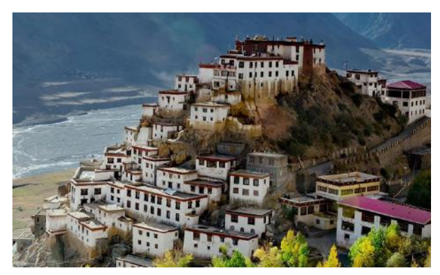
Rammed earth houses in Spiti, Himachal Pradesh

Rammed Earth Homes . Rammed earth homes are typically found in the Spiti Valley of Himachal Pradesh as well as Ladakh. Rammed earth is a natural construction technique that involves compacting a damp mixture of soil with correct proportions of clay, sand, gravel, and occasionally a stabilizing material such as cement. This soil mixture is placed in formwork or temporary frame and compacted. The temporary formworks are removed after the soil mixture has dried and hardened. Rammed earth provides excellent thermal mass. Thermal mass absorbs or slows down the passage of heat through a material and then releases that heat when the surrounding ambient temperature goes down.