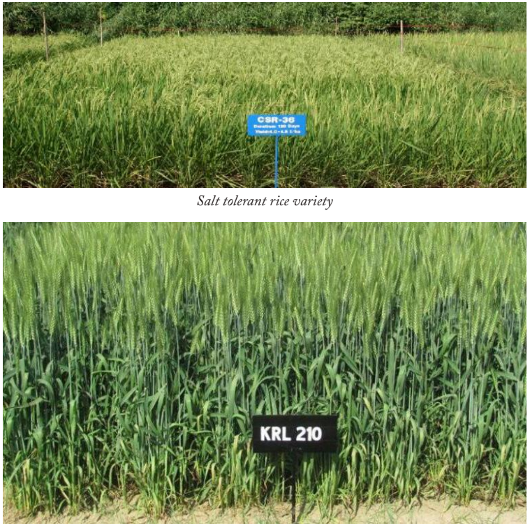
Salt tolerant wheat variety

hectares of agricultural lands every year in India. Examples of such crops include rice (CSR 30, CSR 36), wheat (KRL 1, KRL 2, KRL 3, KRL 4, KRL 19, KRL 210, KRL 213), mustard (CS 54, CS 56, CS 58), etc.