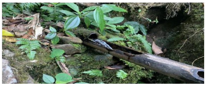
Bamboo drip irrigation in Meghalaya

Bamboo Drip Irrigation . Farmers in Meghalaya have long used traditional bamboo drip irrigation systems to irrigate their plantation crops. This system of irrigation involve the diversion or transportation of water from perennial springs located high up on the hills to the foothills through bamboo pipes. This technique was further refined by constructing rainwater harvesting ponds/tanks on the hilltop itself.