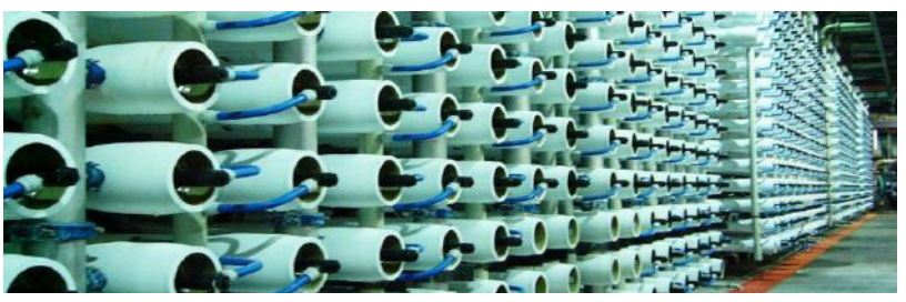
The 100 MLD Minjur desalination plant in Chennai, Tamil Nadu

Cloud Seeding . Cloud seeding is a weather modification technique aimed at enhancing precipitation from clouds. It involves manipulating existing clouds to try and help them produce more rain or snow. This is done by firing small particles (usually silver iodide) into clouds. Water vapour gathers around the particles and eventually falls as precipitation. India has been experimenting with this technique at least since the 1950s. The experiments are carried out primarily by the Pune-based Indian Institute of Tropical Meteorology (IITM). In recent years, a number of states in India have shown interests in pursuing cloud seeding to address their water problems. Karnataka for example has carried out cloud seeding exercise in 2017 under a programme called Varshadhare . The exercise was deemed to be successful and was repeated several times since.