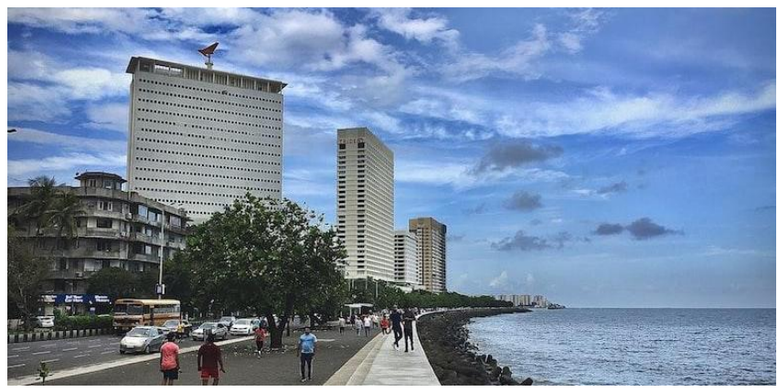
Seawall in Mumbai

Groynes . Groynes are narrow, shore-perpendicular hard structures designed to interrupt longshore sediment transport by trapping a portion of the sediment that would otherwise be transported alongshore. By doing so, groynes help to build and stabilize the beach environment. Groynes are normally built on exposed and moderately exposed sedimentary coastlines to address erosion hazards. They can be constructed from a wide variety of materials including rock armour, concrete, dolos, tetra-pods, steel piling and hardwood timber. Fosters beach widening, which helps maintain an attractive beach environment that is valuable for recreation and tourism. This is particularly the case when applied along with beach nourishment.