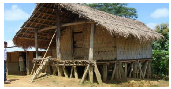
Tong Ghar in Tripura

Chala . Chala is a traditional, curved roofing style that originated from Bengal. The roof is made of local materials like straw or reed. The interior curvature of the roof is supported by bamboo or wooden posts. The hot and humid climate of the region necessitated the deployment of curved roofs. Later, the roof materials were replaced with more durable options like bricks and terracotta. Temples in Bengal have also adopted this form of roofing style. These temples often have one, two, four or eight layers of curved roofs. Hence they are referred to as do-chala , char-chala or at-chala temples.