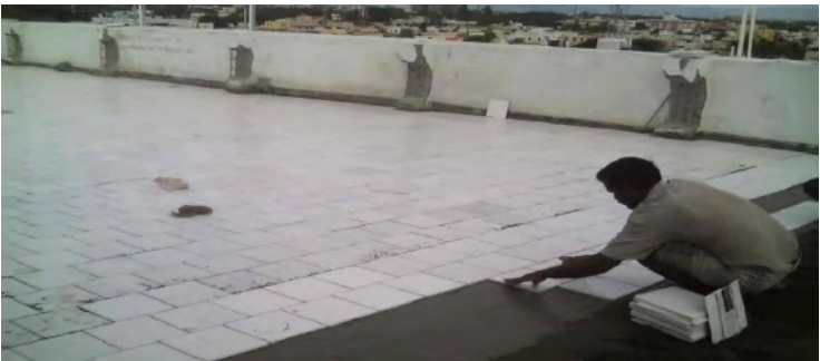
Installing white cooling tiles on a roof of a building in Tamil Nadu

in the state. Not surprisingly, most of the manufacturers and dealers of cool tiles are based in Tamil Nadu. Some of the top brands include ABC Ceramics, Roof Plus, Johnson Tiles, and Insulla.