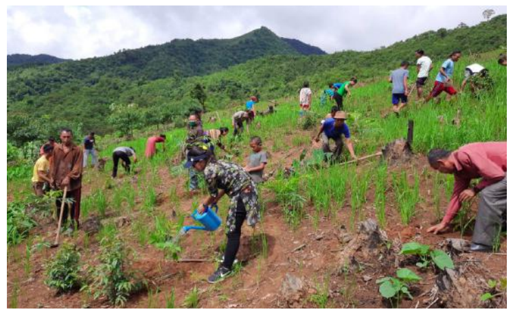
Afforestation programme in Manipur

Afforestation. Every tree in the forest is a fountain, sucking water out of the ground through its roots and releasing water vapor into the atmosphere through pores in its foliage. In their billions, they create giant rivers of water in the air – rivers that form clouds and create rainfall hundreds or even thousands of kilometers away. But continued deforestation risk drying up these aerial rivers and the lands that depend on them for rain. A growing body of research suggests that this hitherto neglected impact of deforestation could in many continental interiors dwarf the impacts of global climate change.