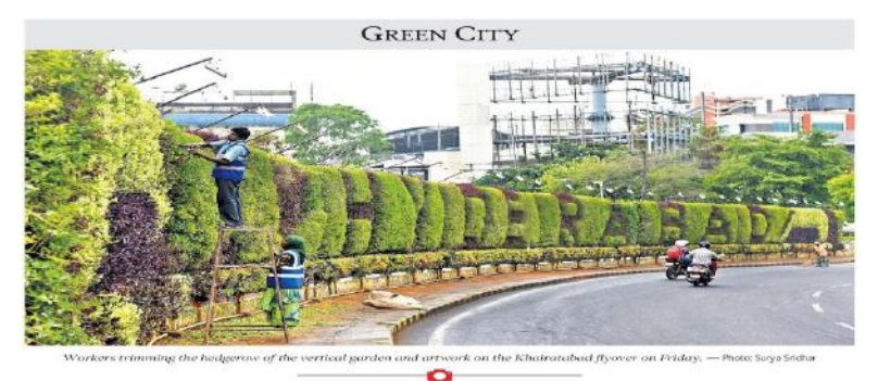
Vertical Garden along a road in Hyderabad

Parks. Urban parks are widely regarded as being highly effective in mitigating the urban heat island effect caused by extensive urbanization and high temperatures associated with climate change. They exerted a general cooling effect and can significantly reduce surrounding land surface temperature depending on the area of the green space and quality of green coverage. Studies on the cooling effect of urban parks in different regions have shown that large scale urban parks with areas over 10 hectares can have an average of 1^{\circ} C to 2^{\circ} C effect on surrounding areas that are an average of 350 meters (0.35 kilometer) away. In general, air temperature reductions in urban parks are typically up to 0.5^{\circ} C to 4^{\circ} C and may even cause up to 5^{\circ} C to 7^{\circ} C reduction. The number of accessible parks in many