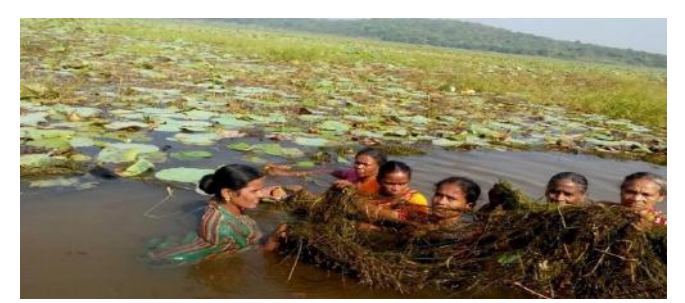
Cleaning the Ansupa Lake, the only freshwater lake of Odisha

Afforestation. Every tree in the forest is a fountain, sucking water out of the ground through its roots and releasing water vapor into the atmosphere through pores in its foliage. In their billions, they create giant rivers of water in the air – rivers that form clouds and create rainfall hundreds or even thousands of kilometers away. But continued deforestation risk drying up these aerial rivers and the lands that depend on them for rain. A growing body of research suggests that this hitherto neglected impact of deforestation could in many continental interiors dwarf the impacts of global climate change.