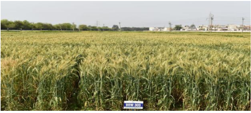
Heat tolerant rice variety

with yield gains of 3.6 per cent and 5.4 per cent respectively. To promote their use, IIWBR has signed 250 Memorandum of Agreements (MoAs) for DBW 187 and 191 MoAs for DBW 222 with private companies for seed production. IIWBR has also distributed more than 2,500 quintal seeds of DBW 187 and 1,250 quintal seeds of DBW 222 during the 2021-2022 cropping season.