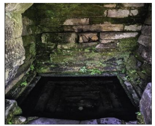
Naula in Uttarakhand

Naula . Naula is a stone-lined tank that catches dripping water from springs. It is primarily found on the hill slopes in the lesser Himalayan region of Kumaon in Uttarakhand. Water from a naula is used to meet the domestic water needs of the local communities. Naula looked like a temple from the outside and is equally regarded as such.