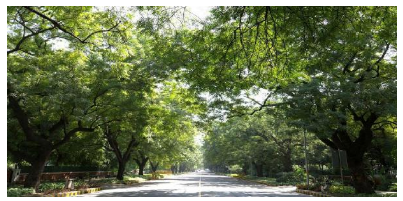
Trees along a road in Delhi

Planting Trees. Tree canopy is considered to be the single-most effective natural solution to urban heat islands caused by streets and buildings absorbing and retaining heat. Trees cast cooling shadows and breathe water vapour out through their leaves, which cools the surrounding air. The water that a single tree transpires daily has a cooling effect equivalent to two domestic air conditioners for a day. According to a first-of-its-kind modelling of 93 European cities by an international team of researchers, increasing the level of tree cover from the European average of 14.9 per cent to 30 per cent can lower the temperature in cities by 0.4°C, which could reduce heat-related deaths by 39.5 per cent. Cities in India are well-endowed with trees. For example, Delhi is known for having "the best tree plantation along roads" among all the major cities of India. The city's roads are lined with structurally large trees with very tall, straight trunks that form excellent sprawling crowns. Also, the trees are indigenous species and are hardy, sturdy, and durable. However, trees in India's cities are increasingly threatened by development. It has been reported that an estimated 112,169 trees have been cut in Delhi from 2005 to February 2018 by the city's Public Works Department (PWD), Delhi Metro Rail Corporation (DMRC), the Railways, etc. Trees will become even more critical in helping people cope with heatwave especially in cities.