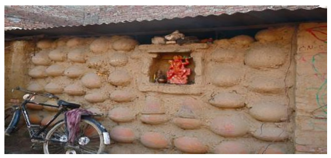
An earthen pots insulation system on a wall in Surat, Gujarat