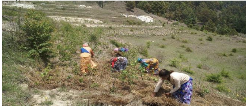
Afforestation in Uttarakhand

maintaining infiltration and storage capacity of the soil. India is currently implementing three major schemes for the development of forest areas namely National Afforestation Programme (NAP), Green India Mission (GIM), and Forest Fire Prevention and Management (FFPM). While NAP is being implemented for afforestation of degraded forest lands, GIM is implemented to protect, restore, and enhance India's forest cover and FFPM is implemented for the purpose of forest fire prevention and management.