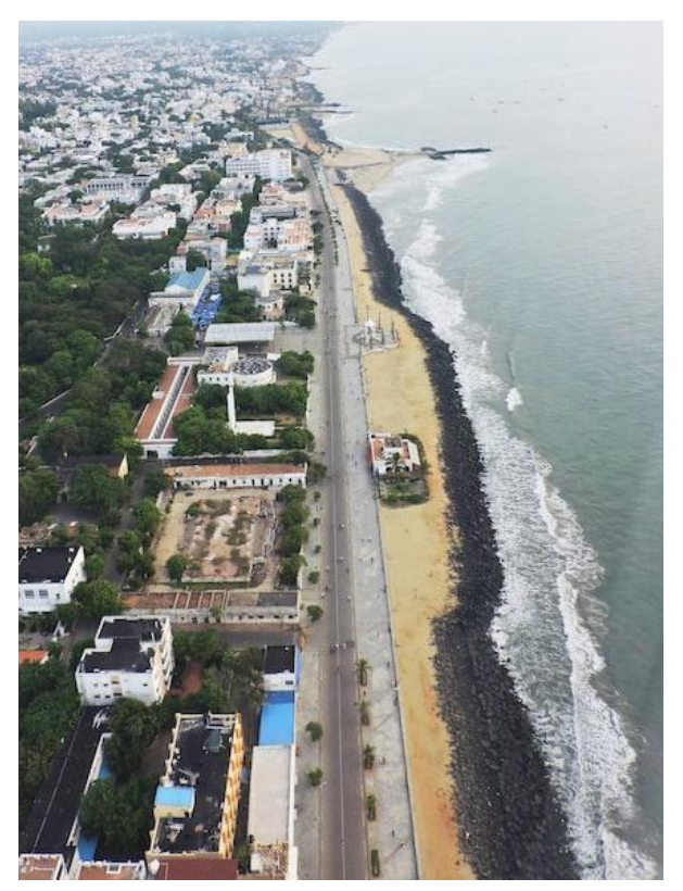
Seawall in Puducherry