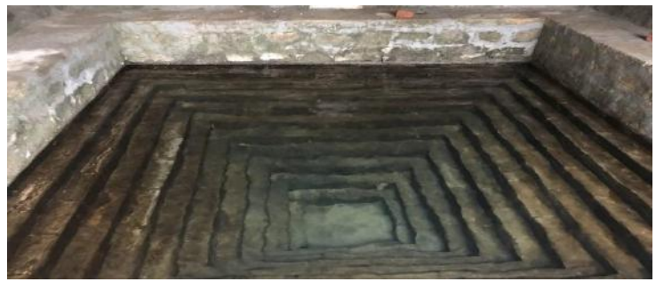
Baudi in Himachal Pradesh

Baudi : Also found in Himachal Pradesh, baudi is a deep stoned pit, which is dug where water percolates naturally from the Earth's surface. It is circular/ square in shape and gently slopes towards the pit in the center. While constructing baudi , the masons placed stones in a particular sequence to have continuous percolation of water from the ground. Baudi is sometimes provided with an outlet and is covered with roof to protect the water. Water from a baudi is primarily used for drinking.