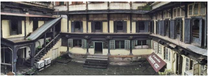
Vishrambaug Wada in Pune was built by Peshwa Bajirao in 1807 It is now home to various government offices

Wada . Wada or 'large mansion' is a type of courtyard house that is found in Maharashtra. It dates back to the time of the Marathas. Wada consisted of two or more storey with rooms arranged around an open courtyard. The courtyard opens to the sky and that ensures light and ventilation. There are two types of Wada . The first type has many families living in it like in an apartment building. The second type has only one family living in it. Meanwhile, the thick walls with few and small openings on the outside provide security against intruders. Wada houses are built using basalt, granite, limestone, bricks, timber, etc. and they are considered cultural and architectural heritage of Maharashtra.