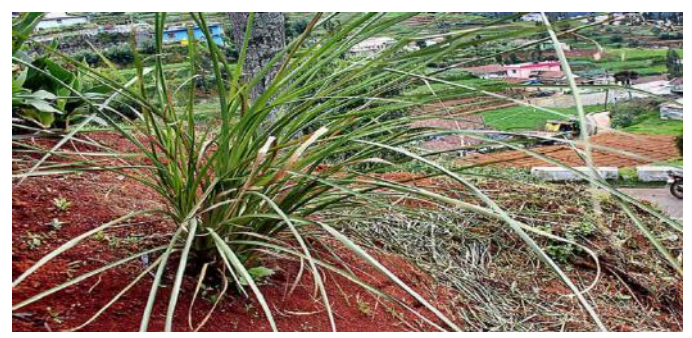
Vetiver Grass in Udhagamandalam in the Nilgiri Hills, Tamil Nadu

Planting Vetiver Grass. Vetiver is a fast-growing non-invasive plant with an extensive, dense and deep root system and strong stems with adaption to large range of climates. It was first developed by bioengineers for the World Bank in India in the 1980s, when they learned that vetiver grass forms a horizontal mat of roots that can grow to four metres below ground level, binding the soil together. This can reduce soil erosion by up to 90 per cent and rainwater runoff by up to 70 per cent. Vetiver grass is increasingly seen as a solution to soil erosion. The grass forms a dense, permanent hedge that prevents soil loss from runoff, thereby improving soil fertility and water quality. Vetiver is now widely used and has proven to be effective, efficient, economical, and sustainable erosion control systems.