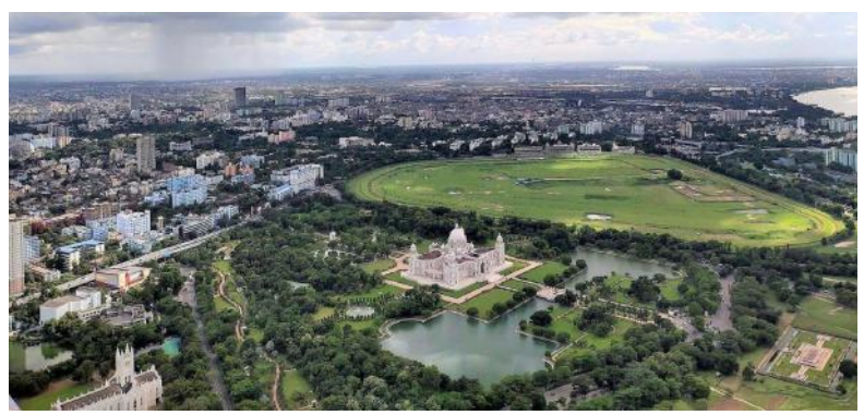
Kolkata's Maidan is the largest urban public park in India