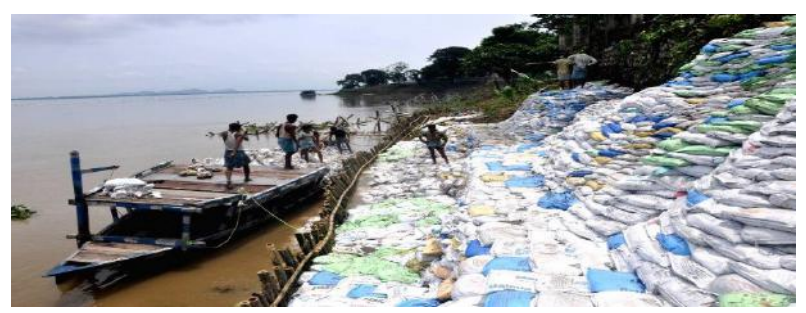
Embankment along the Brahmaputra River in Assam

Embankments . Embankments are artificial banks built along banks of a river to protect adjacent land from inundation by a flood. It is usually earthen and parallel to the course of a river. The embankments or 'bunds' vary in nature and function under a variety of situations. Some embankments are made from compacted soil, but many are made from readily available sand and stones dug from riverbeds. Large embankments are often buttressed with spurs (projections that slow the flow of water), gabion boxes filled with boulders, and sandbags. Embankments confine the flood flows and prevent spilling, thereby reducing the damage from flood. They are generally cheap, quick, and most popular methods of flood protection and have been constructed extensively. As of 2020, a total of 3,790 kilometers of embankment have been built on 13 rivers in Bihar. Meanwhile, Assam has 4,473.82 kilometers of embankments as of 2022. The effectiveness of embankment however has been questioned increasingly.