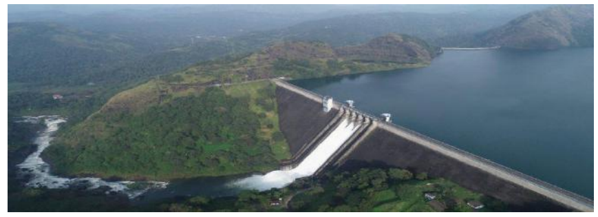
Cheruthoni Dam and the Idukki reservoir in Kerala

Dams . A dam is a structure built across a river or stream to hold back water. Dams can be used to store water, control flooding, and generate electricity. By regulating water flow, dams generally alter the frequency, duration, and timing of annual flooding events. According to the National Register of Large Dams, there are currently 5,264 completed large dams and 437 large dams are under construction in India. In theory, these dams can help moderate floods in the downstream areas. But that depended on the amount of space it has to store water. The lack of space to store more water often necessitated the release of all the water inflows into downstream rivers. As a result, dams can end up increasing the magnitude of flood disasters. Floods caused by dams are sudden, and given its intensity and the unpreparedness of people living in surrounding areas, its impact tended to be more destructive to lives and properties.