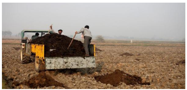
Manure is a key component of natural farming

Pradesh, and Kerala. Studies have reported the effectiveness of natural farming in terms of increase in production, sustainability, saving of water use, improvement in soil health and farmland ecosystem. It is considered as a cost-effective farming practices with scope for raising employment and rural development.