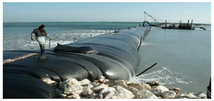
Installing geotextile tube along Odisha's coast

Geo-textile Tube. Geotextile tubes are large, tube-like bags made of highstrength and permeable woven geotextiles and they are used in many civil engineering and erosion control projects like embankments, retaining walls, reservoirs, bank protection and stabilization, as well as coastal erosion control. Geotextile tubes are typically filled with sand and sometimes covered with gabions - a wire box filled with small rocks – and are placed along shorelines and beaches and they are considered good alternatives for the conventional hard coastal structures. A number of coastal states in India including Andhra Pradesh, Orissa, and Kerala have deployed geotextile tubes to prevent coastal erosion.