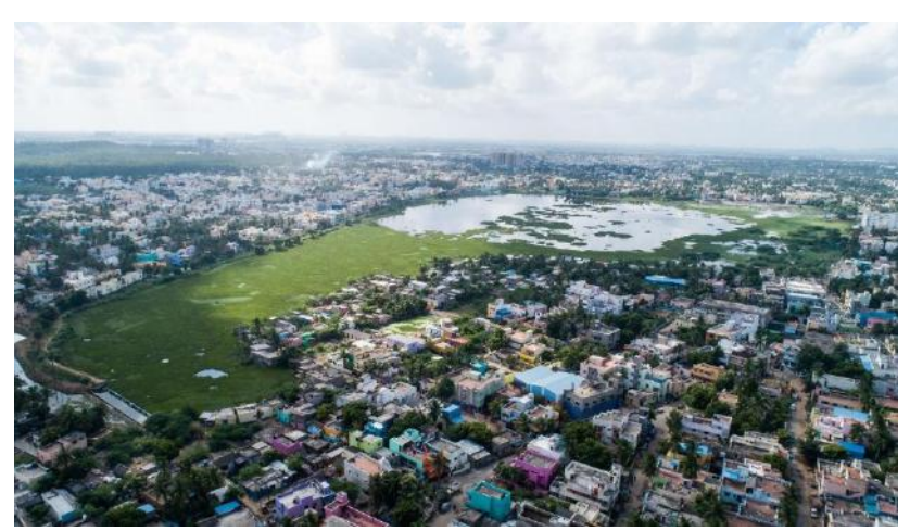
A Wetland in Chennai, Tamil Nadu