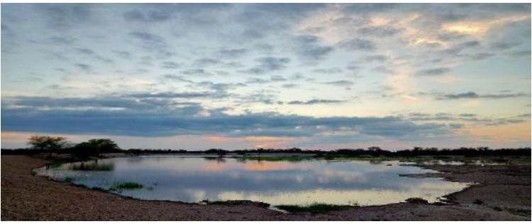
Johad in Rajasthan

held water for livestock. Also, by holding water in place, it allowed it to percolate down through the soil and recharge the aquifer below, as far as a kilometer away. Stored underground, the water could not be lost to evaporation. In the midst of the dry season, without pipes or ditches to deliver water, villagers could always count on water from their wells.