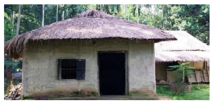
Kheri ghar in Assam

Kheri Ghar. Thatch roofing is a traditional roofing method that involve the use of dry vegetation such as straw, water reed, palm leaves, grass and so on to create a roof covering. In Assam, a local variety of long perennial grass known as kher is often employed to build roof coverings. Also known as cogon grass or blady grass, kher grows abundantly in the Brahmaputra valley. Ripe green kher was cut and dried under the sun until they turn brown. They are then used for roof coverings. Thatch roofs provide excellent insulation since the bulk of the kher grass stays dry and is densely packed thereby trapping air. The mud walls and floor further allowed kheri ghar to maintain comfortable temperature. Mud have high thermal mass. It absorbs heat slowly during the day and releases it slowly at night. That prevented kheri ghar from becoming too hot.