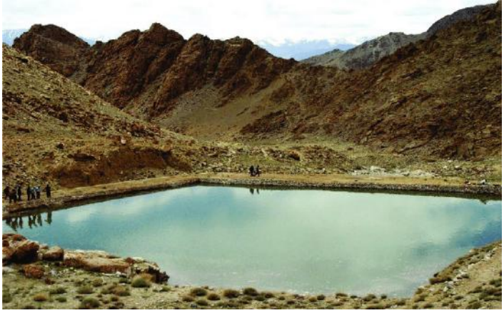
Zing in Ladakh

used in the fields on the following day. A water official called a Chirpun is responsible for the equitable distribution of water in this dry region that relies on melting glacial water to meet its farming needs.