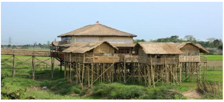
Another example of Chang Ghar in Assam

Kaso Pithiya. Kaso Pithiya is a traditional man-made mound or highland upon which people in flood affected areas of Assam built their houses. The mound is generally built in the shape of a semi-circle and it resembles the shell of a turtle rising above the floodwater. During a flood, land that is temporarily immersed in water can become waterlogged. Kaso Pithiya