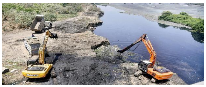
Dredging the Mithi River in Mumbai

Embankments . Embankments are artificial banks built along banks of a river to protect adjacent land from inundation by a flood. It is usually earthen and parallel to the course of a river. The embankments or 'bunds' vary in nature and function under a variety of situations. Some embankments are made from compacted soil, but many are made from readily available sand and stones dug from riverbeds. Large embankments are often buttressed with spurs (projections that slow the flow of water), gabion boxes filled with boulders, and sandbags. Embankments confine the flood flows and prevent spilling, thereby reducing the damage from flood. They are generally cheap, quick, and most popular methods of flood protection and have been constructed extensively. As of 2020, a total of 3,790 kilometers of embankment have been built on 13 rivers in Bihar. Meanwhile, Assam has 4,473.82 kilometers of embankments as of 2022. The effectiveness of embankment however has been questioned increasingly.