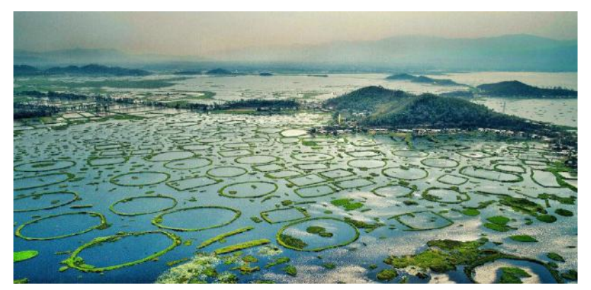
Loktak Lake in Manipur is the largest freshwater lake in Northeast India

Restoring Wetlands. A wetland is an area of land that is either covered by water or saturated with water either permanently (for years or decades) or seasonally (for weeks or months). They consisted of lakes, ponds, marshlands, and swamps. India has large and diverse wetland classes and some of them are unique. Wetlands, variously estimated to be occupying one to five per cent of the geographical area of the country, supports about a fifth of the known biodiversity. In 2011, the Indian Space Research Organisation (ISRO) mapped a total of 7,57,060 wetlands in India covering 15.26 million hectares or 4.63 per cent of the geographic area of the country. Of these wetlands, 75 of them covering 13,266.77 square kilometers are designated as Wetlands of International Importance (Ramsar Sites). These wetlands can play a critical role in reducing the frequency and intensity of floods by acting as natural buffers, soaking up and storing a significant amount of floodwater. A number of wetlands in cities however have disappeared owing to encroachment. A 2021 report by the Comptroller and Auditor General (CAG) of India observed that whereas Bengaluru had 1,452 water bodies during early 1800s, it has only 194 by 2016. Similarly, Chennai once had more than 474 wetlands but more than 85 per cent of them has degraded. The Chennai Municipal Corporation has now prioritized the restoration of 200 wetlands as part of its Smart Cities Initiative and disaster mitigation efforts.