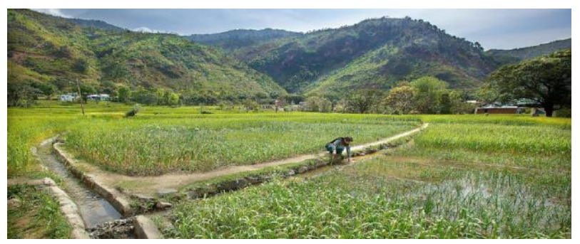
Kuhl in Himachal Pradesh

Kuhl . Kuhl , found in Himachal Pradesh, is a shallow surface channel that divert water from naturally flowing streams or springs, to cultivated fields. Kuhl is usually two meters wide and two meters deep, and it can stretch from 100 meters to even a kilometer. It enable farmers to move beyond subsistence farming and into commercial production of vegetables and plantation of fruit trees. Wasteland has also been converted into productive land for cultivating, expanding the number of hectares under cropping and increasing farmer's income.