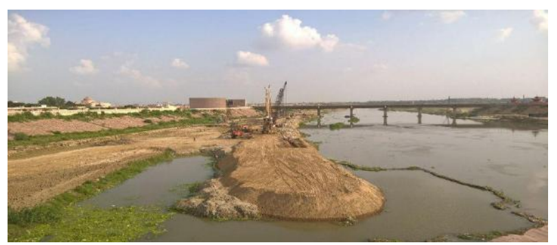
Channelization of the Gomti River in Uttar Pradesh

River Channelization . Channelization is a method of river engineering that widens or deepens rivers to increase the capacity for flow volume at specific sections of the river. As a result, during flood, watercourses can move more efficiently and facilitate more water, which results in less damage to banks. River channelization typically involves dredging to remove sedimentation at the base of the river to increase the flow rates of water. Besides controlling flood, channelization provides erosion control and the rehabilitation of watercourses. River channelization has now been deployed as a solution to control flood in rivers such as the Gomti in Lucknow, Mithi in Mumbai, and Brahmaputra in Assam. River channelization however can cause damage further downstream where efforts to widen or deepen the river have not been undertaken.