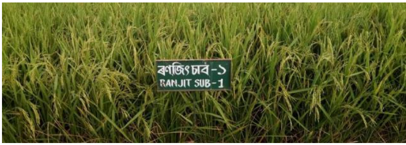
Flood tolerant of rice variety

of hybrid varieties and their inability to tolerate floods have made their cultivation increasingly risky. Hence the shift towards traditional rice varieties.