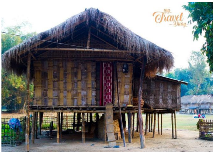
A Chang Ghar belonging to the Mishing tribe in Majuli Island in Assam

bamboo columns set in a concrete base. A flexible joinery system allows homeowners to raise the floor higher if necessary, while cross-bracing bamboo supports make the structure capable of withstanding movement caused by floods and earthquakes.