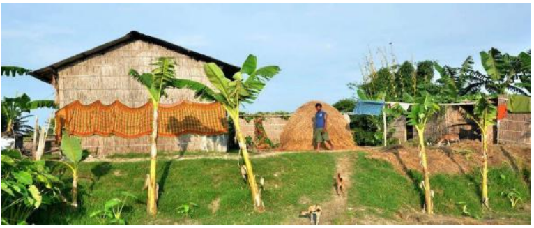
A house built atop Kaso Pithiya in Assam

prevented houses and those living in them from the ravages of floods and waterlogging. Many communities in Assam even build these 'highlands' as a refuge for wildlife. Many animals often climbed on top of them to escape floodwater.