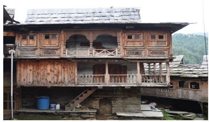
Koti banal in Uttarakhand

Rammed Earth Homes . Rammed earth homes are typically found in the Spiti Valley of Himachal Pradesh as well as Ladakh. Rammed earth is a natural construction technique that involves compacting a damp mixture of soil with correct proportions of clay, sand, gravel, and occasionally a stabilizing material such as cement. This soil mixture is placed in formwork or temporary frame and compacted. The temporary formworks are removed after the soil mixture has dried and hardened. Rammed earth provides excellent thermal mass. Thermal mass absorbs or slows down the passage of heat through a material and then releases that heat when the surrounding ambient temperature goes down.