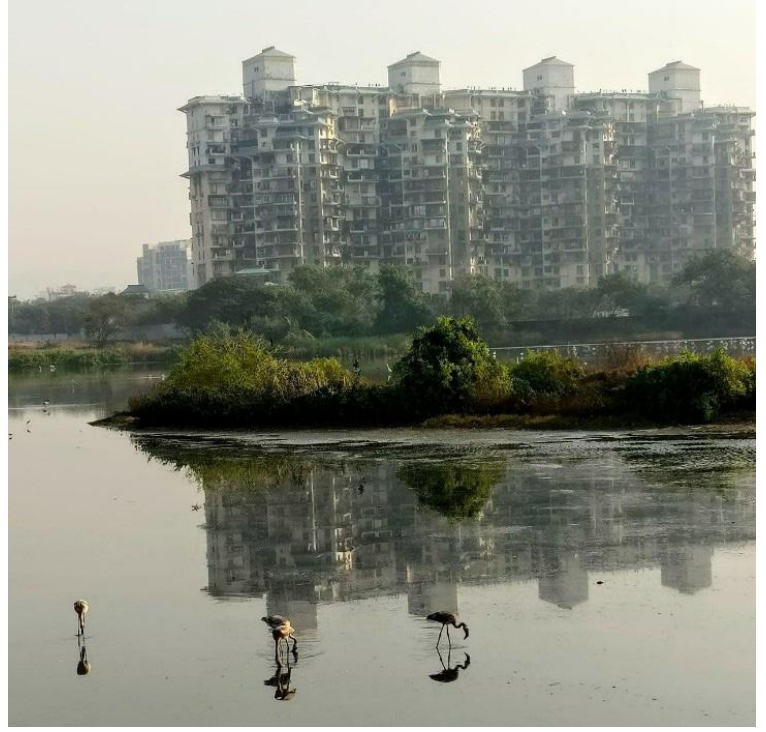
A Wetland in Mumbai

Organisation (ISRO) mapped a total of 7,57,060 wetlands across India covering 15.26 million hectares or 4.63 per cent of the geographic area of the country. Of these wetlands, 75 of them covering 13,266.77 square kilometers are designated as Wetlands of International Importance (Ramsar Sites). Wetlands can exert a cooling affect on cities.