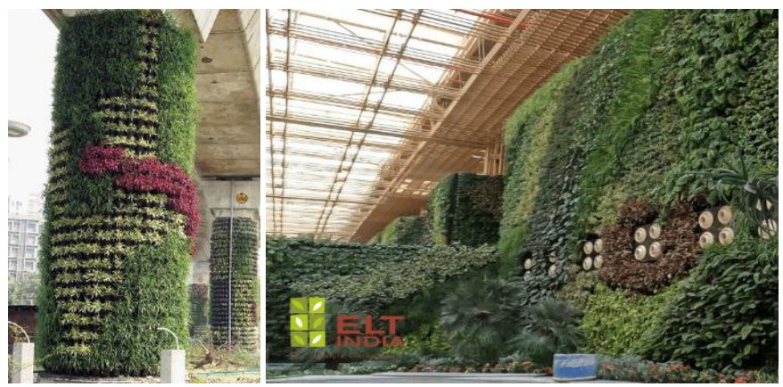
Vertical Garden on a metro pillar in Kolkata