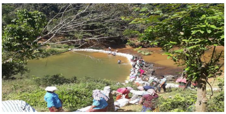
Construction of a check dam following a flood in Wayanad district in Kerala in 2019

Check Dam. A check dam is a small dam constructed across a drainage ditch, swale, or channel to lower the velocity of flow. Reduced runoff velocity reduces erosion and gullying in the channel and allows sediments to settle out. Built using stones, sandbags filled with pea gravel, or logs, check dams are one of the most popular low-cost methods of controlling floods in India.