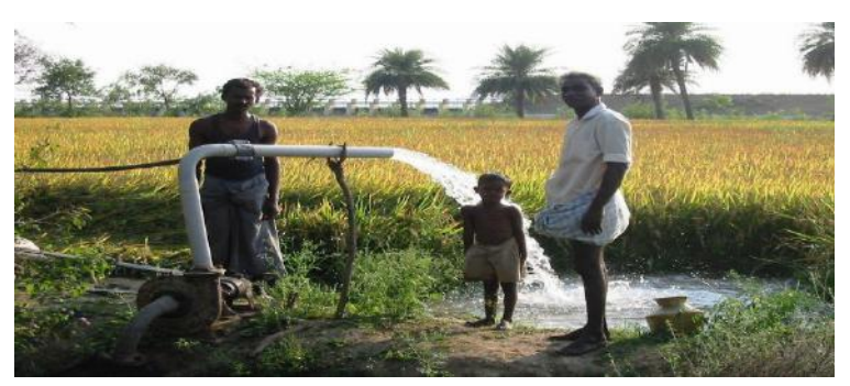
Rice farmers irrigating from a shallow well to complement irrigation water from the Nagarjuna irrigation scheme in Krishna river basin, Andhra Pradesh

Water Recycling. Water recycling, also known as water reclamation, is the process of treating wastewater and reusing it. The wastewater will undergo different filtration processes depending on the purpose. Modern water recycling units use a combination of membrane filtration for the removal of solids, and biological treatment for removing organic and oxidisable matter, combined into a single system called a Membrane Bioreactor (MBR). Water recycling has generated growing interest in India. A 2022 report by NITI Aavog observed that India's urban areas generated 72,368 million litres per day (MLD) of wastewater as of 2021. Of this, only 20,236 MLD or 28 per cent are treated by the country's 1,093 operational sewage treatment plants (STPs). In other words, 72 per cent of India's urban wastewater remained untreated and they are discharged into rivers, ponds, lakes, etc. As such, there is an urgent need to scale up India's urban wastewater recycling capacity especially in the face of growing urban population and water scarcity. The country's urban population was 483 million or 35 per cent of its total population in 2020. This was projected to increase to 675 million or 43 per cent of the country's population by 2035. And by 2050, India's urban population could reach 877 million or 50 per cent of the country's population. Meeting the daily water requirements of this growing urban population requires an increase in India's wastewater recycling capacity.