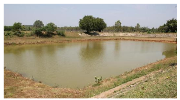
Eri in Tamil Nadu

Eri and Oorani. Eris, which dates back to the time of the Cholas, are a series of cascading tanks or reservoirs contained behind earthen bunds or embankments. They are found primarily in Tamil Nadu and are used for irrigation. Each eri is designed to allow excess water to flow out after reaching full capacity. As such, excess water flows from one eri to the next one in the series. Many eris are still in existence today. As compared to eris, ooranis are much smaller and shallower. And unlike eris, rainwater harvested in ooranis are used primarily for drinking.