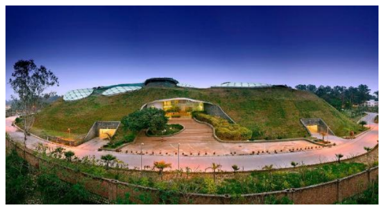
ONGC corporate office in Dehradun