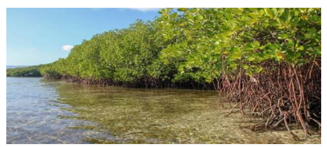
Mangrove forest in the Sundarbans

1,481 square kilometer (29.67 per cent) of the total mangrove cover. "Moderately Dense Mangrove" is 1,481 square kilometer (29.67 per cent) while "Open Mangroves" constitute and area of 2,036 square kilometer (40.78 per cent). There has been a net increase 17 square kilometers of India's total mangrove forest as compared to 2019. This increase however is marginal given that India has lost 40 per cent of its mangrove forest in the last century.