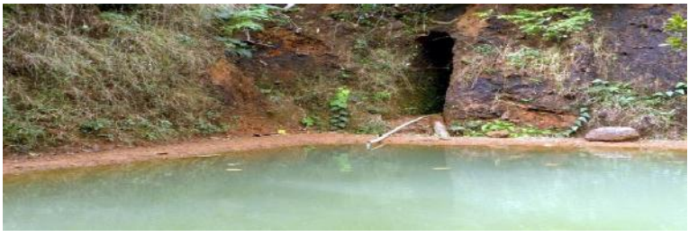
Suranga in Karnataka

to 300 meters into a hill. As water percolates through rock and flows into the tunnel, it is carefully channelised in a narrow stream to a small mud reservoir, built near the tunnel. Surangas have been losing popularity as borewells are much cheaper to dig. As their popularity waned, a growing number of suranga have been abandoned and some of them have even caved in over time.