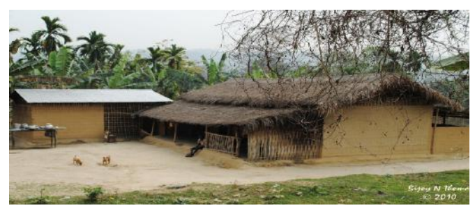
Another example of kheri ghar