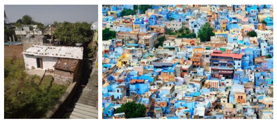
A low income house painted with white colour in Madhya Pradesh