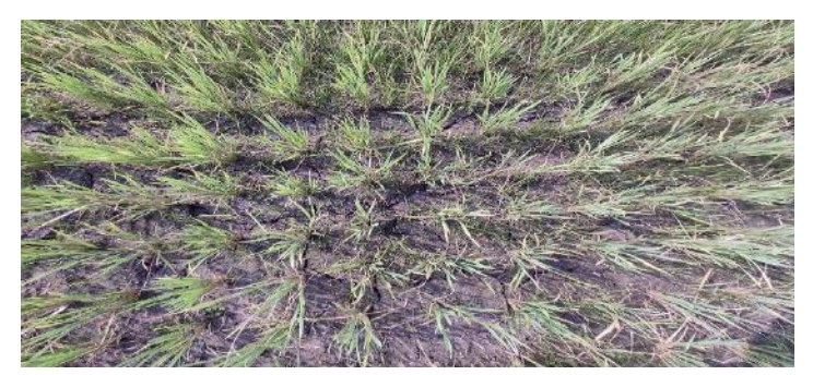
In SRI, seedlings are planted in lines further apart than in traditional methods

The application of biomass (compost, manure, green manure, etc.) to build healthy and productive soils is also a recommended practice. SRI has resulted in increased grain yields; better grain filling and grain quality; better resistance to drought, storm damage and flooding due to larger/ healthier root structure; improved pest/disease resistance; reduced seed requirements; water conservation; reduced production costs; reduced need for pesticides and agrochemicals; reductions in methane and arsenic levels achievable through reduced flooding of rice fields, etc. In addition to irrigated rice, SRI principles have been also applied to rainfed rice and other crops such as wheat, sugarcane, finger millet, pulses, etc. When SRI principles are applied to other crops, it is referred to as System of Crop Intensification (SCI). SRI is now adopted widely in India.