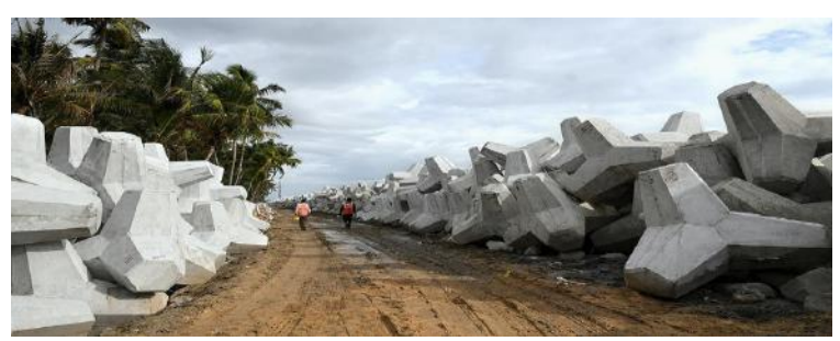
Tetrapod seawall in Kerala

coastline of Chellanam. The project will cover 10 kilometer of shoreline in two phases. The first phase measuring 7.2 kilometers has been completed.