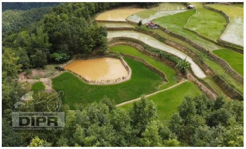
Zabo in Kikruma village, Nagaland

and conservation measures. Protected forests that are located high up in the hills serve as the water catchment area. Gravitational flow and manmade channels directed water from the catchment area to water harvesting ponds that are located further downhill. The sides and bottom of these ponds are rammed and compacted to reduce seepage. Finally, water from the ponds is channelled to terraced paddy fields and fishery ponds that are located further downhill from the ponds. The ponds not only serve as a water reservoir for irrigation but they are also a source of drinking water for cattle and other animals of the village. Animal husbandry activities are usually located near and above the water-harvesting pond.