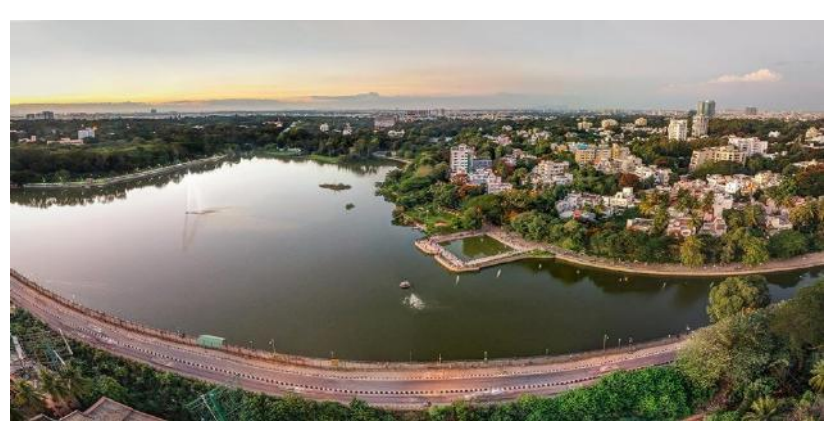
A lake in Bengaluru

Afforestation. Forests can soak up excess rainwater and prevent run-offs and damage from flooding. By releasing water in the dry season, forests can also help provide clean water and mitigate the effects of droughts. The volume of water retained by forests can depend on characteristics such as forest cover area, the length of vegetation growing season, tree composition and density, as well as the age and the number of layers of vegetation cover. Water retention by forests affects the amount and timing of the water delivered to streams and groundwater by increasing and