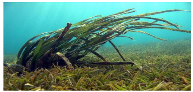
Seagrass off the Andaman and Nicobar Islands

occur all along the coastal areas of India. The main coastal areas with rich seagrass meadows are Palk Bay and Gulf of Mannar (14 species), Andaman and Nicobar Islands (12 species), Lakshadweep Islands (10 species), Odisha (8 species), and Gujarat (8 species). Greater protection of these seagrasses will enable India's coastal areas to adapt to the impact of climate change such as sea level rise and storm surges better.