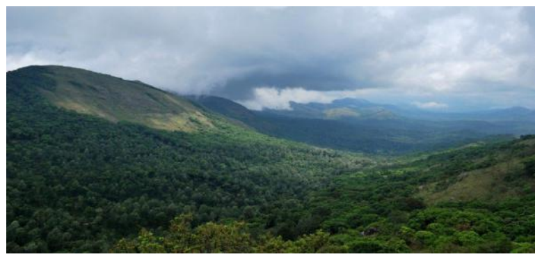
The Western Ghats

Conservation of Forests. Role of forests as carbon sponges is well established. But comprehensive new data suggested that forests deliver climate benefits well beyond just storing carbon, helping to keep air near and far cool and moist due to the way they physically transform energy and water. Forests emit chemicals called biogenic volatile organic compounds (BVOCs) which create aerosols that reflect incoming energy and form clouds - both are cooling effects. Deep roots, efficient water use and socalled canopy roughness further enabled forests to mitigate the impact of extreme heat. These physical qualities allow trees to move heat and moisture away from the Earth's surface, which directly cools the local area, and influences cloud formation and rainfall - which has ramifications far away. India has a total forest cover of 7,13,789 square kilometer as of 2021. That is 21.71 per cent of the country's geographical area. Without its forests, India would be much hotter and the weather more extreme. Better protection, expansion, and improved management of forests therefore is critical.