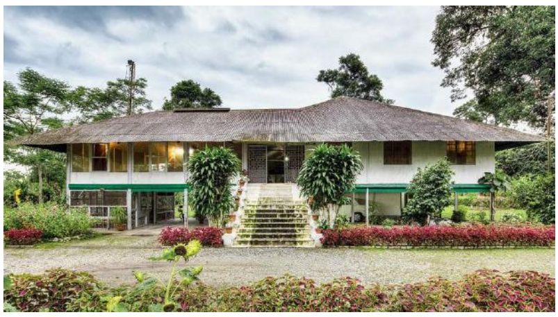
A Bungalow at the Kumlai Tea Estate in West Bengal

Its general design - with wide hallways, high ceilings, large windows, and shade-giving verandas – helped distribute air throughout the building and is therefore well-suited for hot and humid tropical climate. Also, the house was raised above the ground and that protected it from flooding. This basic model was adopted with modifications almost everywhere British imperial rule existed at that time.