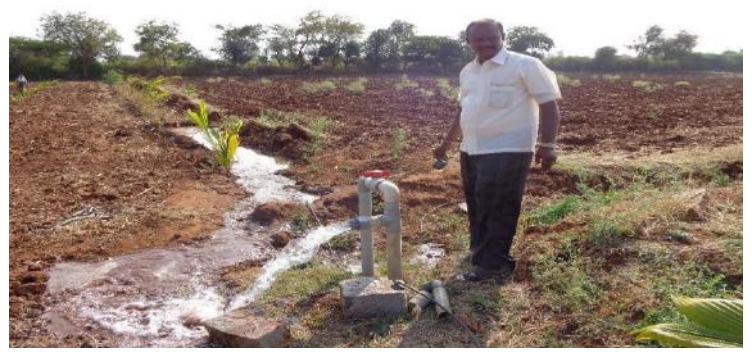
A borewell in Chitradurga in Karnataka

Borewells and Tubewells. These are vertical drilled wells bored into an underground aquifer to extract water for various purposes. Borewell is now perhaps the most common source of water in urban India. It typically draws water from "confined deep aquifers," i.e. rock layers deep underground where water is trapped under pressure between the cracks of rocks. These aquifers are formed over many years, sometimes even centuries, due to water percolating down the rock layers. In cities, heavy machinery is used to dig borewells up to depth of 1,800 feet. India now has around 33 million borewells, making the country the largest user of groundwater in the world.