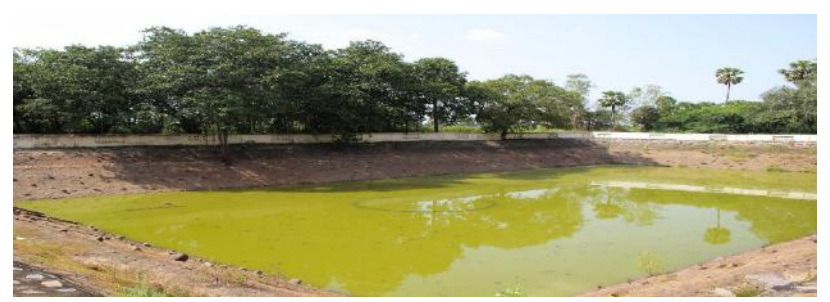
Oorani in Tamil Nadu