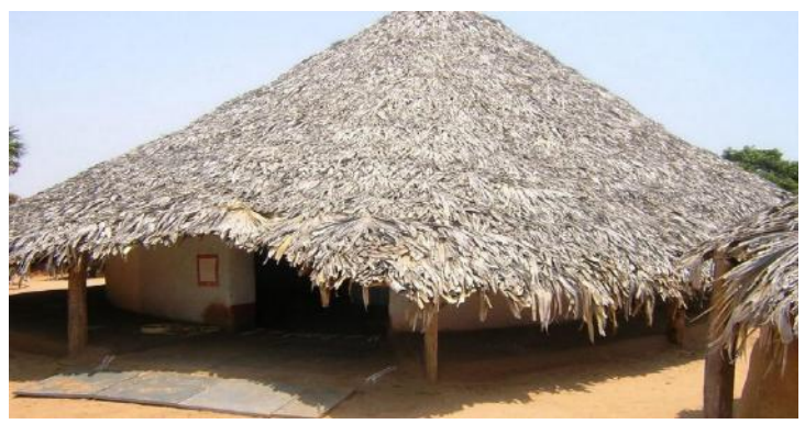
Chutillu in Andhra Pradesh

Chutillu . Chuttillu is a circular house and they are typically found along the coastal areas of Andhra Pradesh. The house is constructed using wood, clay, cow dung mixed with margossa leaf paste and turmeric, sand, straw, and water. The room provided ample ventilation as they were circular and, more importantly, they were cool during hot summer months.