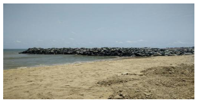
Groyne in Tamil Nadu

Groynes . Groynes are narrow, shore-perpendicular hard structures designed to interrupt longshore sediment transport by trapping a portion of the sediment that would otherwise be transported alongshore. By doing so, groynes help to build and stabilize the beach environment. Groynes are normally built on exposed and moderately exposed sedimentary coastlines to address erosion hazards. They can be constructed from a wide variety of materials including rock armour, concrete, dolos, tetra-pods, steel piling and hardwood timber. Fosters beach widening, which helps maintain an attractive beach environment that is valuable for recreation and tourism. This is particularly the case when applied along with beach nourishment.