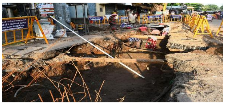
Stormwater drain project in Chennai, Tamil Nadu

Drainage Improvement . India has been undergoing rapid urbanization. That has led to an increase in impermeable surfaces such as roads, pavements, and driveways. As a result, surface water run-off has also increased. Well-designed drainage systems therefore are critical as it allow for effective discharge of stormwater, reducing property losses and expenditures on recovery. In many cities across India, many of the urban wastewater and stormwater systems were designed with limited capacity and have become overwhelmed by flow increases spurred by hydrologic change and urban growth. Besides, open drains on the edge of pavements often are clogged with silt, plastics, and other solid waste block drains and waterways during the rainy season, resulting in water spilling over roads. Cities like Chennai has now embarked on an ambitious project of constructing new stormwater drains across the city for flood mitigation.