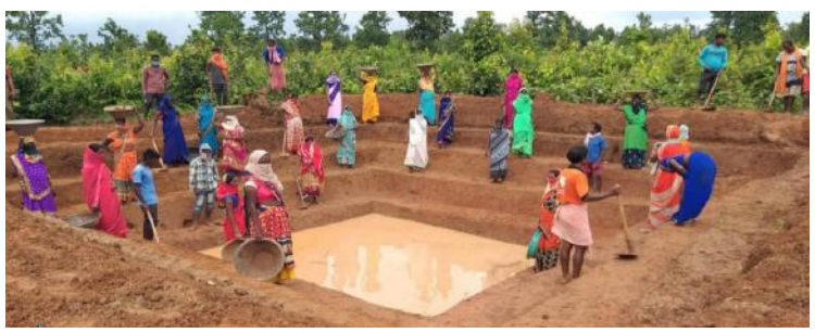
Digging Dobha in Jharkhand

Dobha . In Jharkhand, rainwater is harvested for use during the dry season in ponds locally referred to Dobhas . Dobhas are dug in low-lying areas where rainwater could accumulate. Each dobha can store up to 25,000 to 30,000 liters of rainwater. The harvested water is used for irrigation and it help reduce farmer's dependence on monsoons and allow them to diversify their crops.