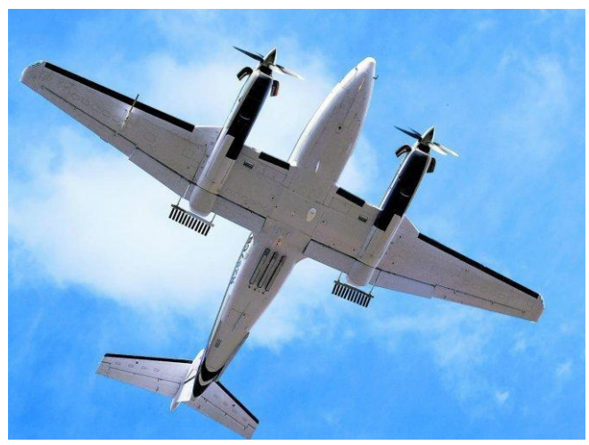
Cloud seeding plane in Karnataka