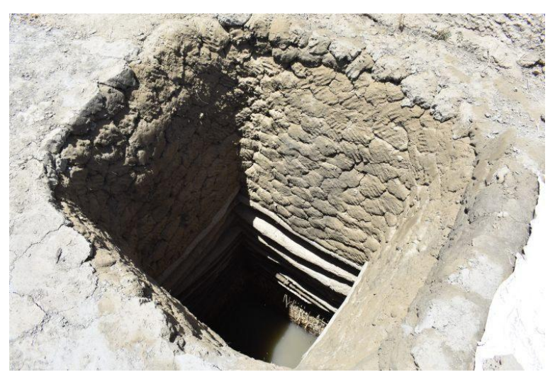
Virda in Gujarat

Virda . Virda is a well that is found all over the Banni grasslands in the Great Rann of Kutch region of Gujarat. It was dug by the nomadic Maldharis who used to roam the grasslands. The topography of the grasslands are undulating and is pockmarked by depressions. By studying the flow of water during the monsoon, the Maldharis identified these depressions and dug virdas there. After rainwater infiltrated the soil, it gets stored in the virdas . A structure was then built to access the water.