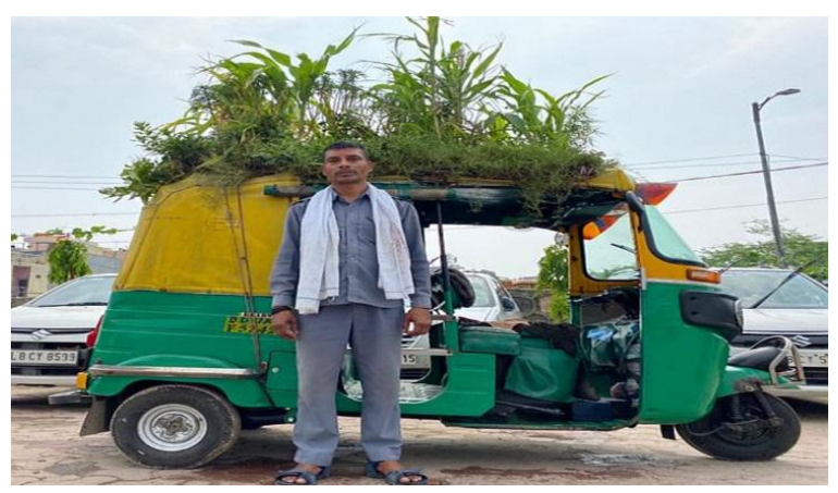
A personalized "garden-auto" in New Delhi