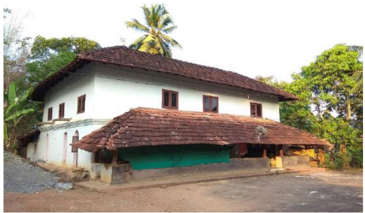
Nalukettu in Kerala

Chutillu . Chuttillu is a circular house and they are typically found along the coastal areas of Andhra Pradesh. The house is constructed using wood, clay, cow dung mixed with margossa leaf paste and turmeric, sand, straw, and water. The room provided ample ventilation as they were circular and, more importantly, they were cool during hot summer months.