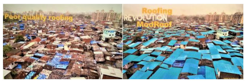
Modular panel roofs are now the roof of choice in many low-income houses in Ahmedabad, Gujarat

Earthen Pots Insulation System. Use of earthen pots to keep roofs cool has been traditionally practiced in hot and dry areas of India. Locally available earthen clay pots are affordable and exhibits high thermal insulation property. Roofs (and sometimes even walls) are covered with upside down earthen pots and then cemented in place. That traps air between the original roof and the final surface and provides insulation. This method helps keep building cool in summer and warm in winter.