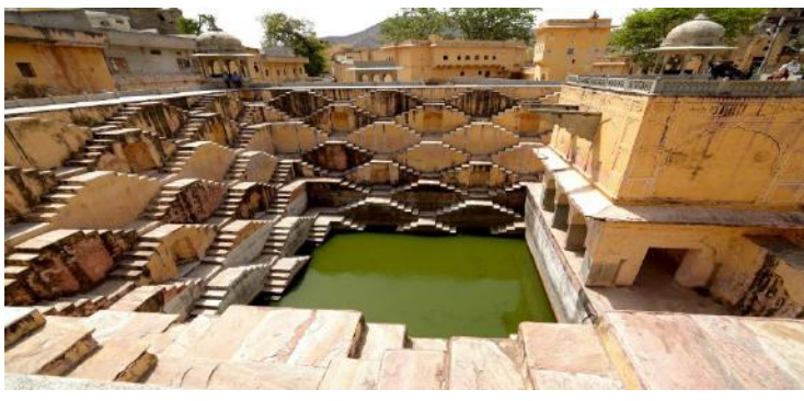
Panna Meena ka Kund in Jaipur, Rajasthan

Baoli . Baolis are step-wells built to provide water for drinking and agriculture. They have existed for over 1,000 years and were constructed in towns and alongside serais (travellers'inns), across the Thar Desert and into Delhi. Baolis exist in all shapes and sizes and are essentially reservoirs built into the earth. Groundwater is pulled up from a circular well at the bottom and rainwater is collected from above.