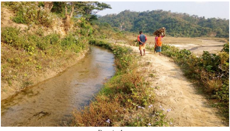
Dong in Assam

Dong . Dong is a traditional irrigation method practiced by the Bodo community of Assam. Bodos are an ethno-linguistic group who live primarily on the north bank of the Brahmaputra River below the foothills of Bhutan and Arunachal Pradesh. Dong consisted of one main earthen canal that is 12 feet wide and three to 10 feet deep. This main canal diverts water from rivers. Water flowing through the canal is again diverted to villages through a network of sub-canals known as shakas and prashakas . The flow of water in these sub-canals is regulated by dams made from tree branches, stones, and boulders. Water is released from the main canal to the sub-canals to the sub-canals reaches villages and fields. Building and maintaining dongs is a community effort.