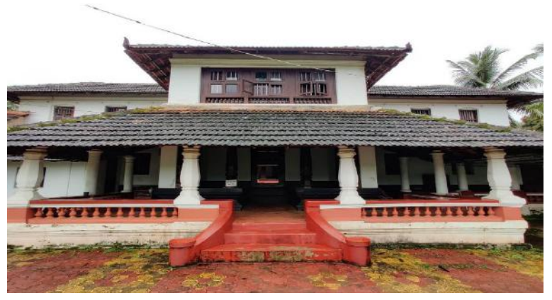
Guthu mane in Karnataka

Guthu Mane . In Karnataka, Guthu Mane is built to fit the requirements of matrilineal joint families. As such, they are large, square in shape, and have ample space for storage. All Guthu houses had a veranda that acted as a sit-out. The houses usually emphasised a lot of woodwork. The doors were made from intricately carved teakwood or rosewood. Ornate and exquisitely sculpted wooden pillars decorated the interiors of the inner courtyard. These pillars supported a decorated wooden ceiling, which usually had designs of mango and floral motifs, foliage, and coin patterns. Solid wooden beams held this grand ceiling.