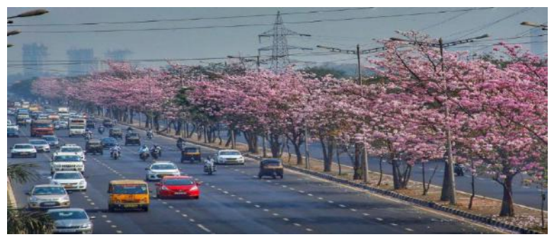
Trees along a road in Mumbai

Vertical Gardens. Vertical gardens, also known as green walls, are vertically suspended panel on which plants are grown using hydroponics. They can either be freestanding or attached to a wall and are a wonderful alternative to potted plants in the built environment. Potted plants provide flexibility in placement, but they take up space and require a great deal of maintenance. Vertical gardens take up very little, if any, floor space. Vertical gardens are more than just a trendy design feature. While they are installed primarily to improve air quality, the benefits of vertical gardens are many. They can also regulate the temperature through transpiration and cools home. Given these advantages, cities across India have now installed vertical gardens along major roads, buildings, and on the concrete pillars of flyovers and metro rail lines. Also, they have increasingly become a major feature of hotels and retail developments across India.