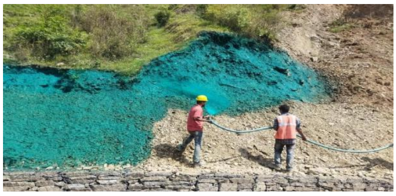
Hydroseeding along a road in India

the cost compared to developing revetments or concrete structures on vulnerable hill slopes.