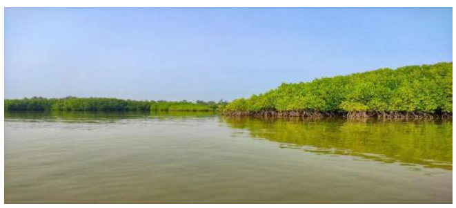
Mangrove forest in Karnataka

Seagrass Preservation. Seagrasses are flowering plants with long ribbonlike leaves that often grow in the sea in lush underwater meadows. These plants protect coastal areas from erosion and flooding by dissipating the hydrodynamic energy through their submerged canopies or structural complexity. They also absorb carbon from the atmosphere up to 35 times faster than tropical rainforests, stores 10 per cent of the annual ocean carbon storage across the globe and locks up that carbon in sediments. Seagrasses also provides sanctuary to many marine wildlife. Seagrasses