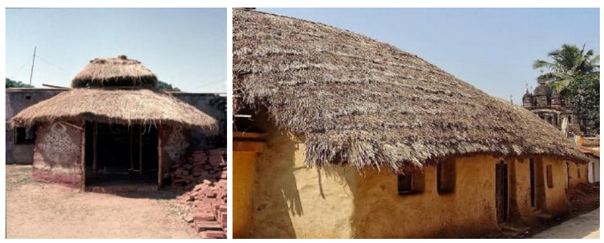
A hut with a chala roof in West Bengal

Chala . Chala is a traditional, curved roofing style that originated from Bengal. The roof is made of local materials like straw or reed. The interior curvature of the roof is supported by bamboo or wooden posts. The hot and humid climate of the region necessitated the deployment of curved roofs. Later, the roof materials were replaced with more durable options like bricks and terracotta. Temples in Bengal have also adopted this form of roofing style. These temples often have one, two, four or eight layers of curved roofs. Hence they are referred to as do-chala , char-chala or at-chala temples.