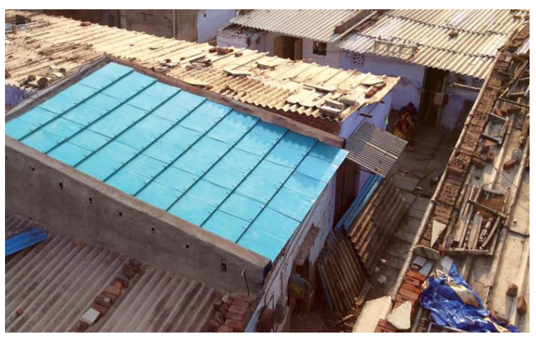
Modular panel roofs are replacing metal sheeting and poor quality cement in a slum in Ahmedabad, Gujarat

ModRoof. ReMaterials, a startup based in Ahmedabad, Gujarat has developed an interlocking modular roofing system called ModRoof. ModRoof is made from waste, pulped cardboard, and natural fibers that were both sturdy and waterproof. The insulation, along with an air gap inside the panel, helps keep the heat out. ModRoof is especially targeted at low income home owners, most of whom lived in houses that have roofs made from thin corrugated metal sheets or thin cement. ModRoof can hold a weight of up to 180 kg, last for about 10 years, costs 50-60 per cent less than concrete slab roofs, and provide better insulation and it costs Rs. 190-200 per square feet.