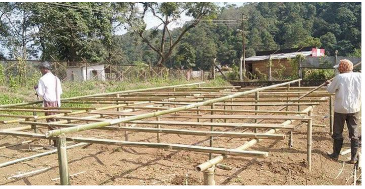
Layout of modified bamboo drip irrigation system in Meghalaya

That ensured water availability even during the dry season. The water that are harvested in the ponds/tanks is then transported directly to farms