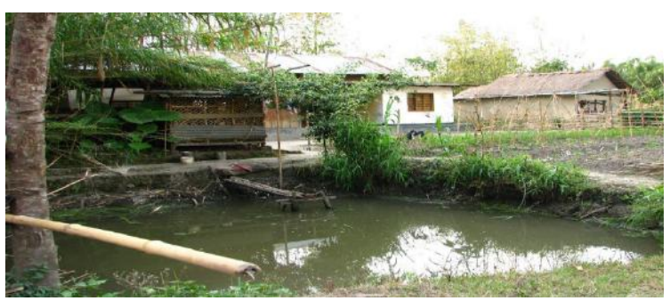
A household Pukhri in Manipur

Pukhri . In Manipur, rainwater is harvested for use during the dry season in ponds locally referred to as Pukhris . Water from pukhris was originally used for drinking and other household uses, but over the years, people also breed fish in them for personal consumption, and also to earn additional income.