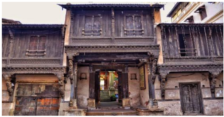
Pol houses in Ahmedabad, Gujarat

and richly embellished facades with intricate decorations, including carvings of religious symbolism. The design elements of Pol houses allow less radiation of heat. Moreover, the open courtyard conserve the cool breeze and the water tank below it keep the surface cooler. The clay roof tiles also kept the rooms cooler, creating a bearable microclimate within pol houses. Pols houses of Ahmadabad that was founded by Sultan Ahmad Shah in 1411 AD was declared a UNESCO World Heritage Site in 2017.