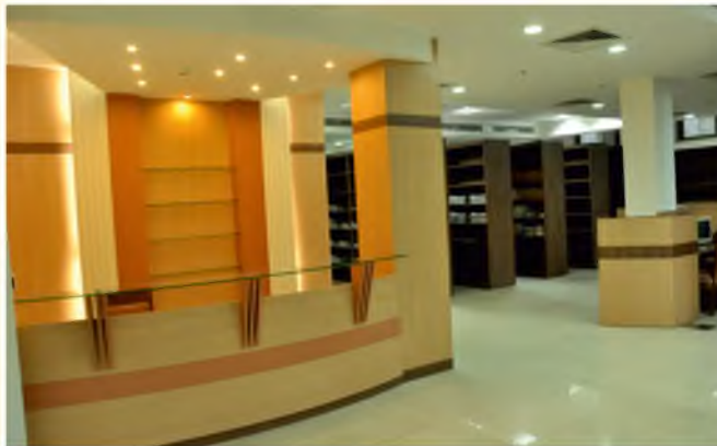
Resource Research Centre