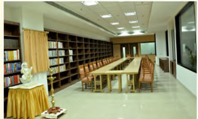
Resource Research Centre