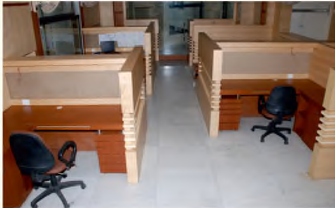
Research Work Stations