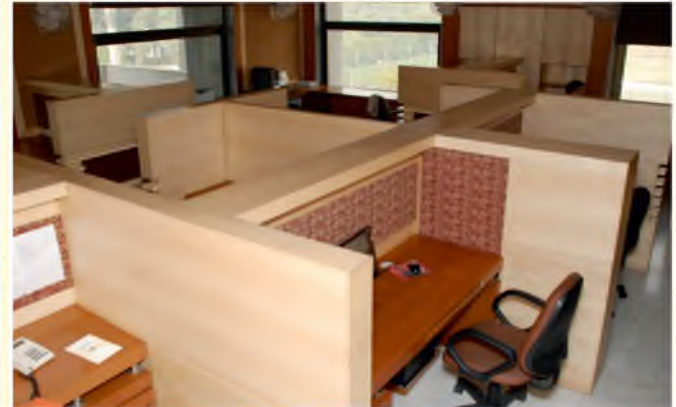
Research Work Stations