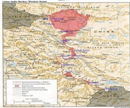
Map 3: Points of Ingress in the Western Sector

After the ceasefire, Beijing, while repudiating the proposals relating to military disengagement that was worked out under the ‘Colombo Plan’, offered “not to establish even civilian check posts in previously-held Indian strong points”, stipulating further that, “India would have to return to existing military positions along the entire frontier and refrain from placing civilian check posts in previously-held Chinese areas” (sic). Thus while the matter was left inconclusive, PLA Border Guards located themselves in their better liveable camps much to the East into Aksai Chin, the key bases being located astride the Western Tibet Highway – at