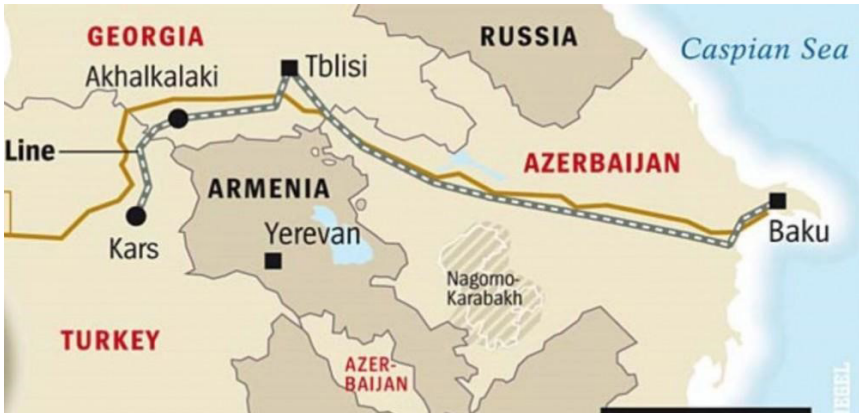
Figure. 2 Baku–Tbilisi–Kars (BTK) Railway