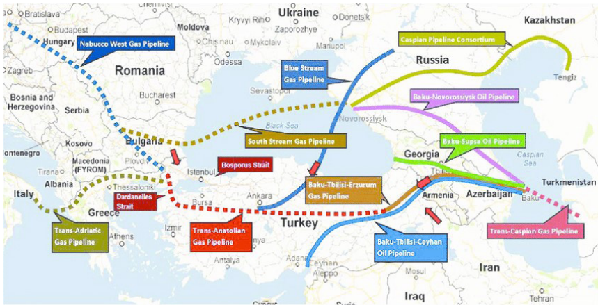
Figure 3- Operational and Proposed Oil and Gas Pipelines from Caspian to Europe