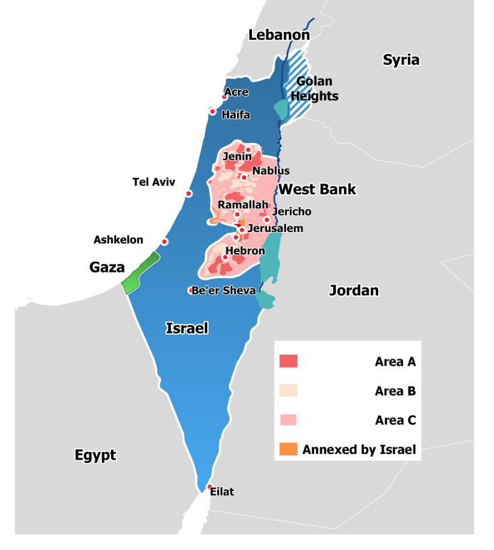
Figure 2: Map of Israel and Occupied Palestinian Territories

However, the democratic credentials suffer from inherent flaws in terms of usage of Emergency Regulations that authorise the government to execute excessive use of power to suspend political and civil rights especially on non-Jews. Moreover, due to absence of written constitution, the laws concerning protection of minorities are insufficient (Smooha 2002; Smooha 2013; Dowty 1998).