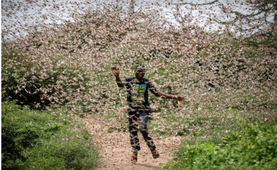
Locust swarm – The inspiration for swarm drones.

https://www.google.com/search?q=locust+swarm+three+times+thesize+of+new+york+city