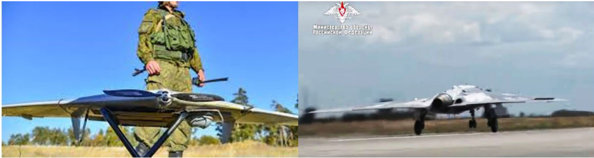
Russian Flock 93 and Okhotnik Projects

be operating with manned combat platforms like SU 57 in the MUM-T mode taking on the targets as designated by operating a totally autonomous mode. It can also detect best approach routes avoiding adversary's air defences thus saving manned platforms.