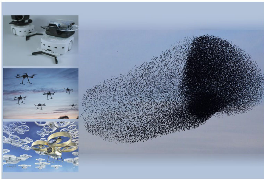
Intelligent drone swarms

https://www.google.co.in/search?q=intelligent+swarm+drones&tbm