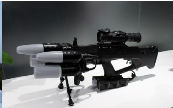
REX anti-drone hand gun Russia

https://www.google.co.in/search?q=Drone+dome+system+israel&tbm