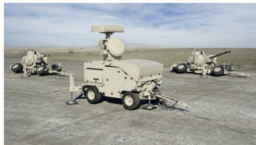
35mm gun with Skyguard Radar

Air Defence weapons deployed at Saudi Oil Facility