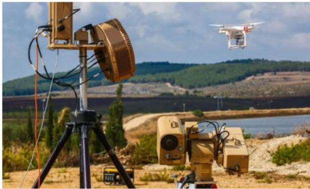
Drone Dome System - Israel