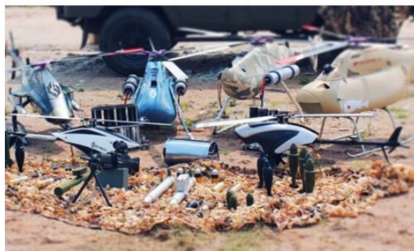
Chinese helicopter drones

https://www.google.com/search?q=Chinese+helicopter+swarm+drones&tbm