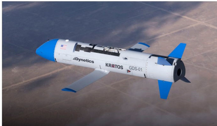
Gremlin drone- USA

https://www.google.com/search?q=US+gremlin+drone&tbm=isch&ved=2ahUKEwi2ip-Q3MHo-AhUKkEsFHfrUDhIQ2-