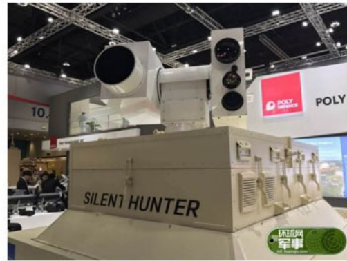
Silent Hunter System China