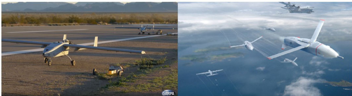
CODE and OFFSET Projects of US

Also, on building offensive capabilities human managers are using the tools of virtual reality to control the formations of hundreds of drones. The acronym, given to this activity in US is 'Offensive Swarm- Enabled Tactics (OFFSET).