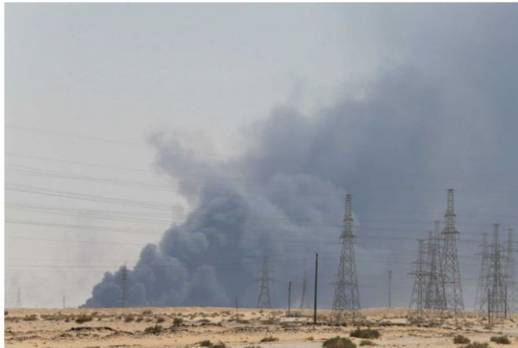
One drone attack – 5.7 million barrels stalled