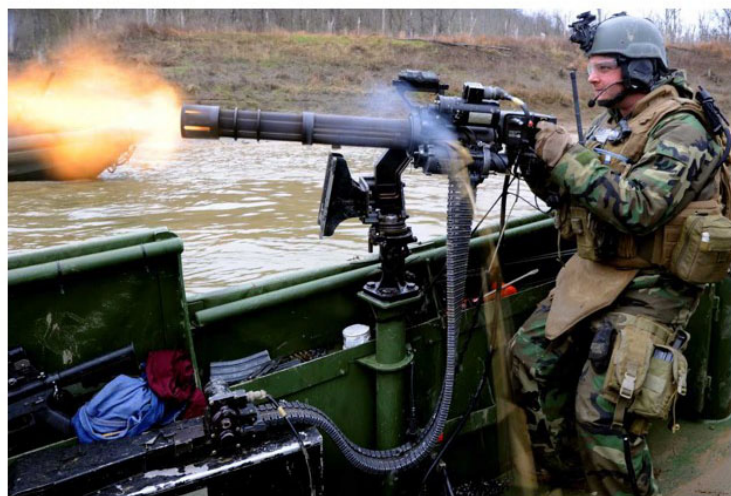
M133 GAU- 17 Gatling gun

In the conventional mode, ground based air defence guns with rates of fire in the range of thousands of rounds-per-minute are capable of creating a ball of fire in a volume of space that is populated by a swarm drone. Keeping in mind that the density of the drones in a finite volume of space will be high there will be a good chance of debilitating large number of them. (For instance, M133 GAU- 17 Gatling gun has a rate of fire of 2000-6000 rounds per minute 7 )