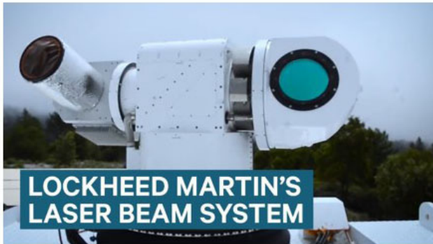
ATHENA – Lockheed Martin