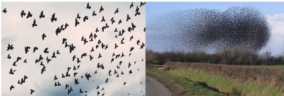
Flocking algorithms in birds and intelligence of a swarm have guided drone swarms

Actually each sensor on board the UAS in the swarm will produce its own output. Technology allows the fusion of inputs from multiple sensors into one comprehensive picture shown to the user who has every control over shaping the output, with respect to sensor pan/tilt, range, field of view, altitude, resolution, selective area -zoom etc.