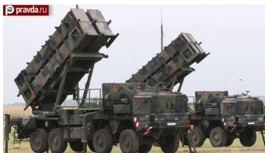
MIM 104 Patriot SAM system